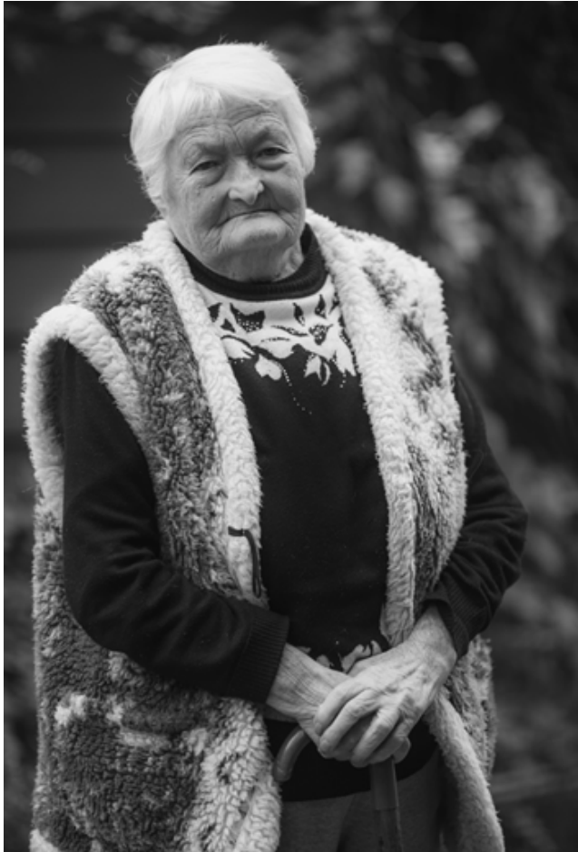
“A Glance that Flows with Time” from the Master’s photo art project “Never Again?!”