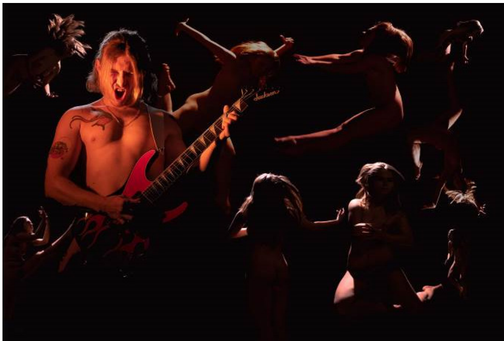
"Eros Weapon" of the Photo Art Project "Erotics in Photography: from Analogue to Digital. PART 2"

Camera / Lens Fujifilm XT-3 / Fujinon XF 35mm f/2.0