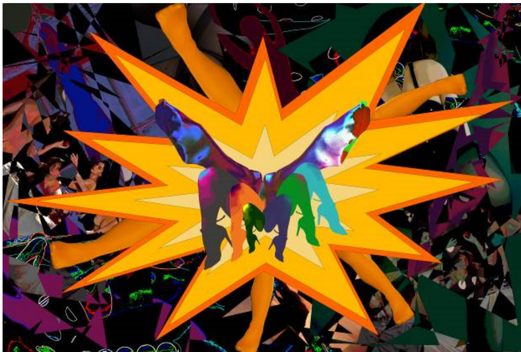
“Bang” of the Photo Art Project “Erotics in Photography: from Analogue to Digital. PART 2”